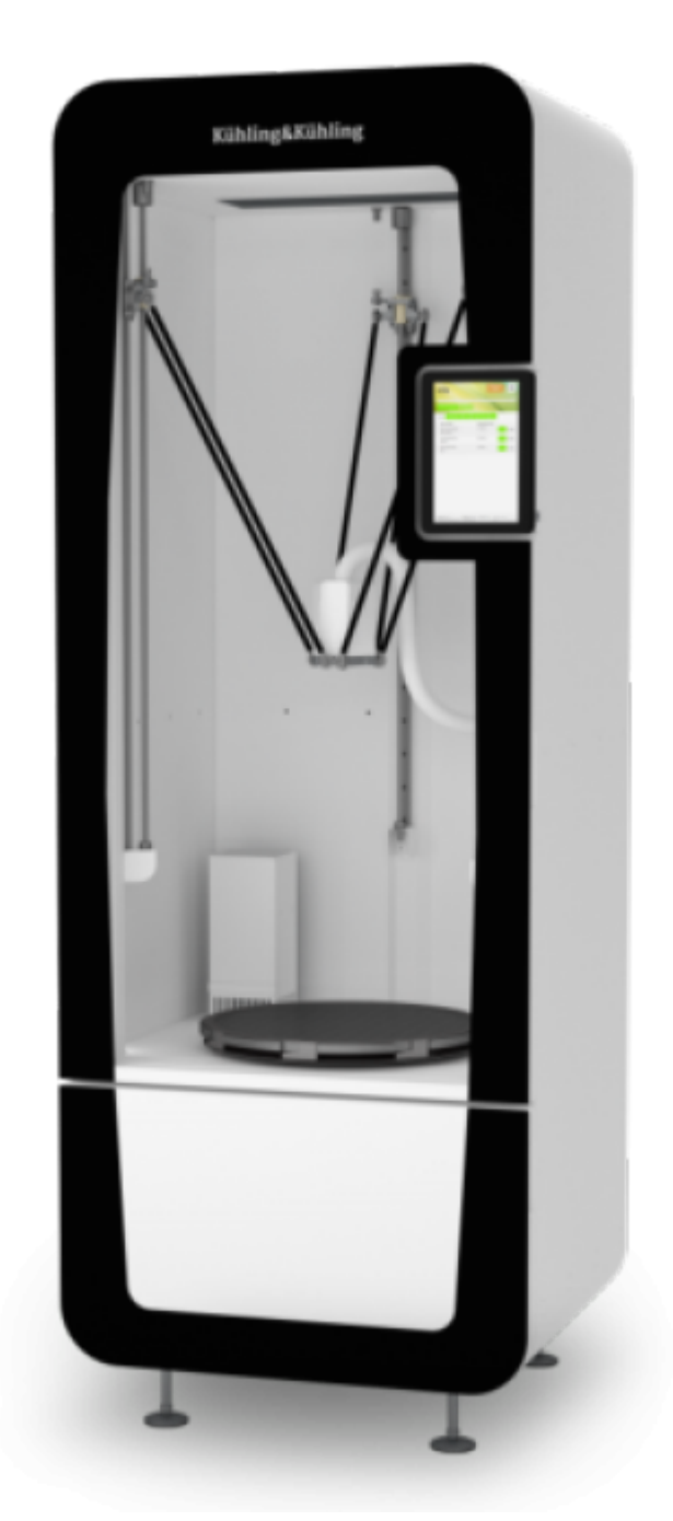
The Kühling&Kühling VP75 Additive Manufacturing System

Welcome to the operating manual for the VP75 Additive Manufacturing System of the Kühling&Kühling GmbH (in the following referred to as Kühling&Kühling).